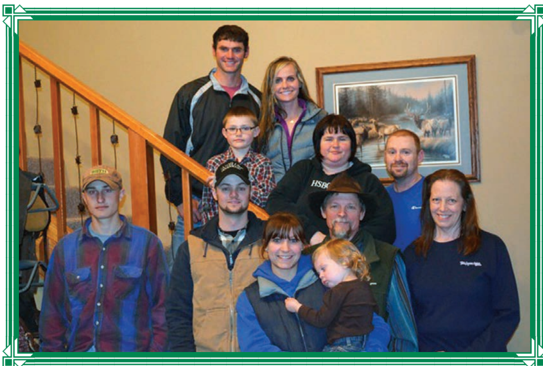
AI and Branding Crew